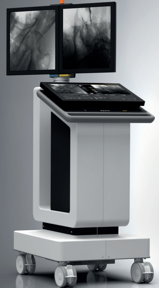
The Unique Biplanar System