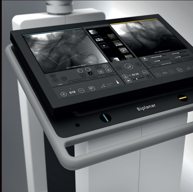
Touch Panel Interface